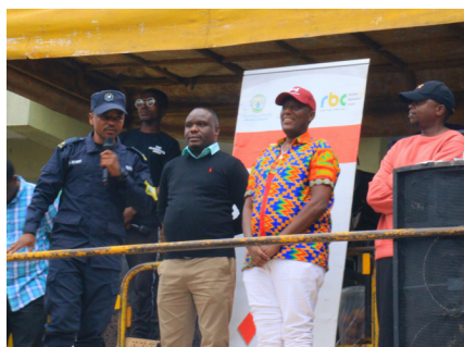
Law Enforcement Officer, Burera District

"Before this training, I didn't fully understand the challenges PWUDs face. Walking in their shoes made me realize how simple changes in attitude can make healthcare safer and more welcoming."