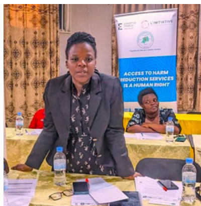
Healthcare Provider, Rubavu District

"Seeing the community come together to learn about HIV and TB prevention reminded me that knowledge truly saves lives. When people are empowered with information, they protect themselves and their loved ones."