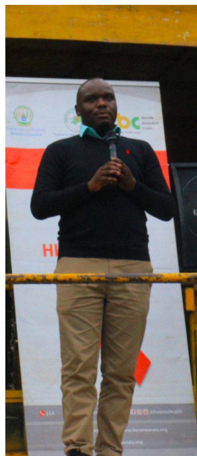
Vice Mayor Social Affairs, Burera District

"The role play opened my eyes. I realized how harmful assumptions are. We need to serve without judgement."