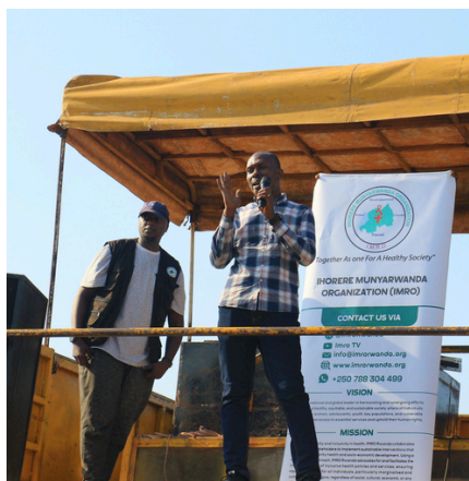
Community Health Mobilizer, Nyanza District

"When you teach someone how to use a condom correctly, you are not just preventing infection you are giving them power."