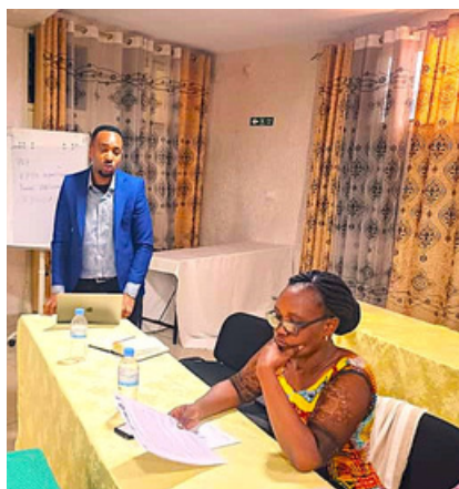
Director of Health, Rubavu District

"When you teach someone how to use a condom correctly, you are not just preventing infection you are giving them power."